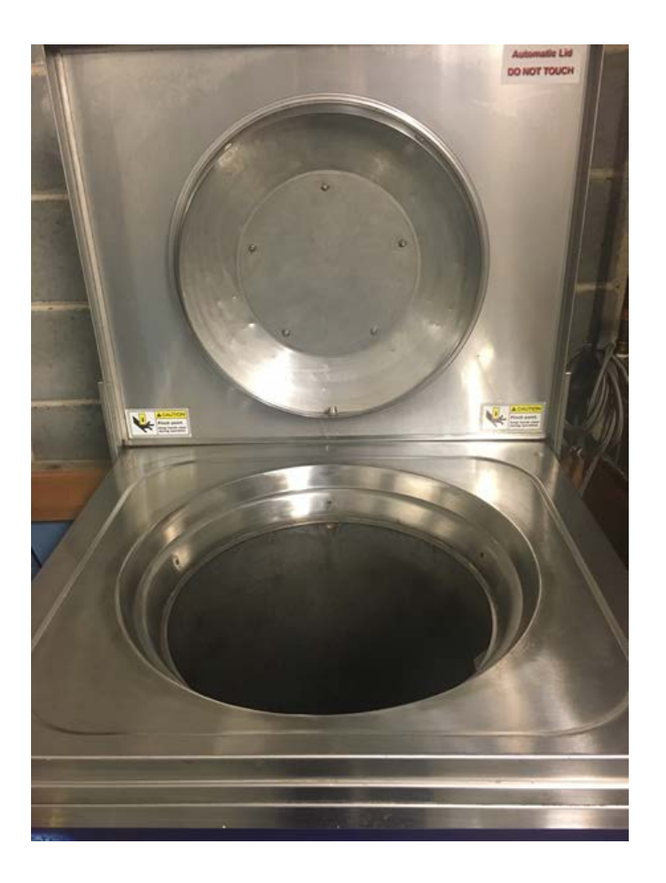
Processes 70 Litres per load in 60 seconds