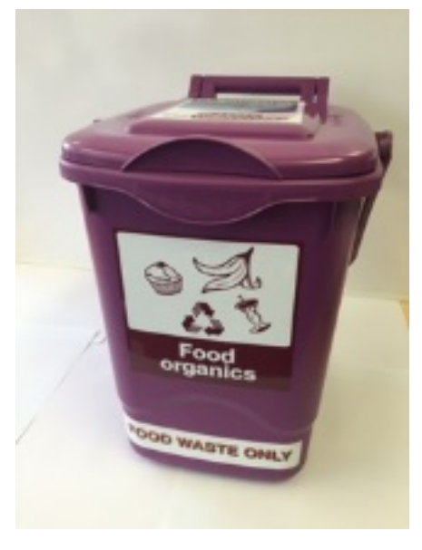
23L Pulpmaster Caddy